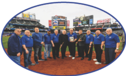
NYS KNIGHTS OF COLUMBUS RECEIVING THE SPIRIT AWARD 2019

Join us at Citifield* on FRIDAY, MAY 27, 2022 AT 7:10 PM to watch the RIVALRY HEAT UP between the PHILLIES & METS